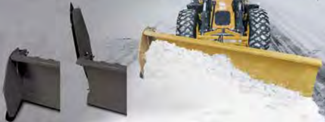
Driveway Shield CLOSED

The hydraulically controlled shield opens and closes quickly to prevent snow from drifting in driveways. Put snow in its place and minimize hand shoveling so you're ready to move on to the next job.