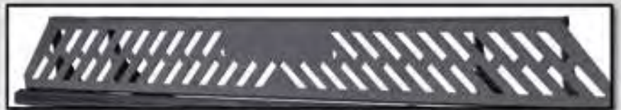
Moldboard Design Promotes Efficient Rolling of Snow Optional Spill Guard