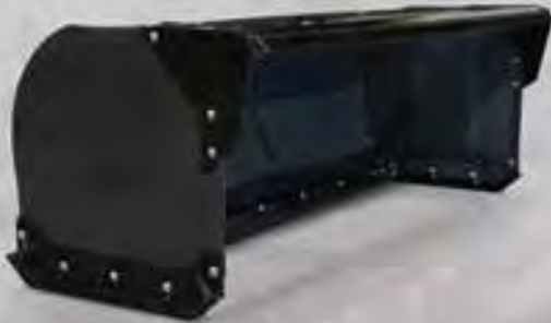
Shown with Optional Back Drag