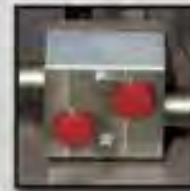
Cross-Over Relief Valve