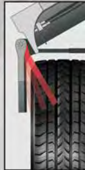
Tire Protection System