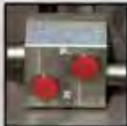
Cross-Over Relief Valve