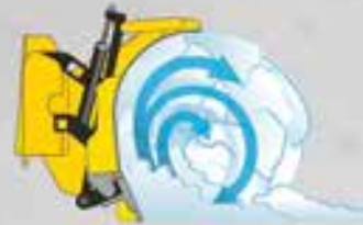
Moldboard Design Promotes Efficient Rolling of Snow

HotSpring is an industry-first, dual-action design that eliminates damage-prone rubber mounts by using heavy-duty springs, increasing strength and scraping power.