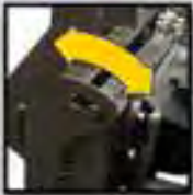
*Optional Forward Float

*Optional for 400/500/600 models (not available for 300)