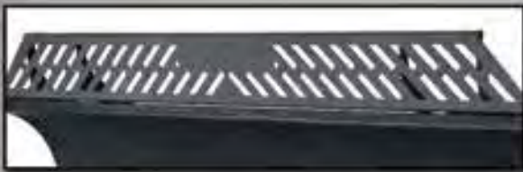
Optional Spill Guard