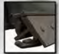
Spring-Trip Cutting Edge

*Optional for 400/500/600 models (not available for 300)