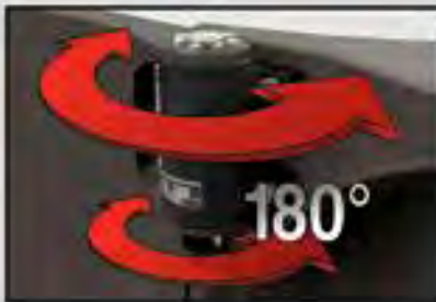
180° Pivot Range Rotary Actuator