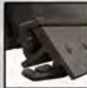
Spring-Trip Cutting Edge