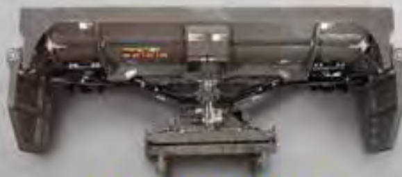
REVERSE BOX BLADE