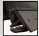
Spring-Trip Cutting Edge