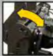
*Optional Forward Float