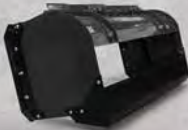
Optional Back Drag