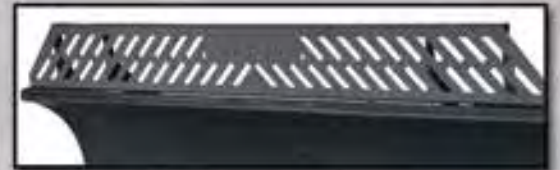
Optional Spill Guard